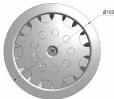
Item no. 12560